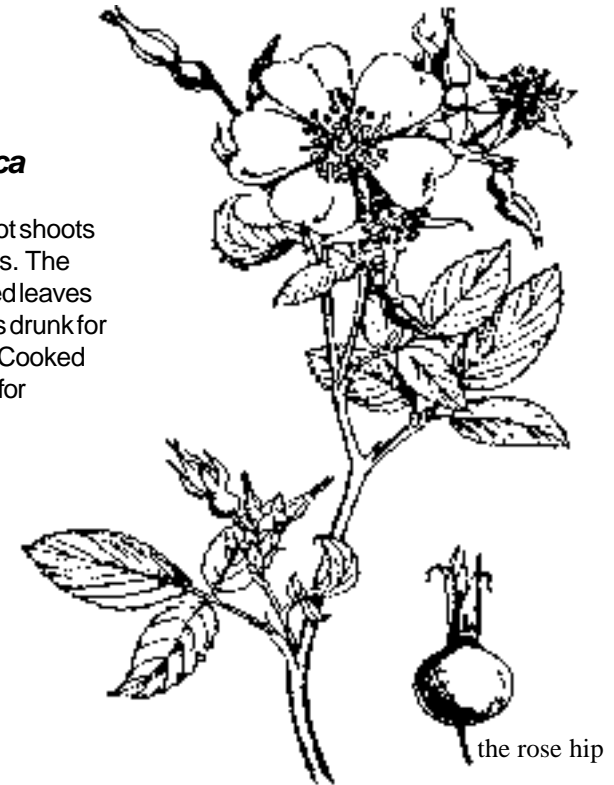
the rose hip

A tea of tender root shoots was used for colds. The liquid from steeped leaves and rose hips was drunk for pains and colics. Cooked seeds were eaten for muscular pain.