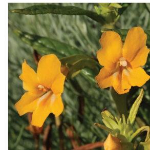
Sticky Monkey Flower