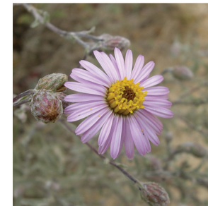
Branching Beach Aster