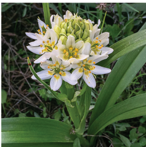
Fremont's Star Lily