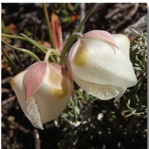
White Globe Lily