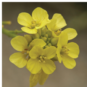
Summer Mustard (non-native)