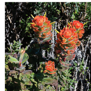
Seaside Painted Cup