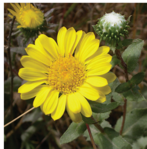
Coastal Gum Plant