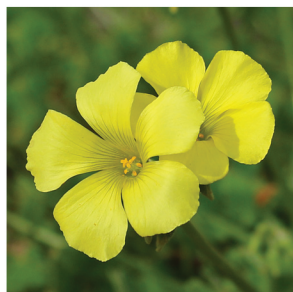
Bermuda Buttercup (non-native)