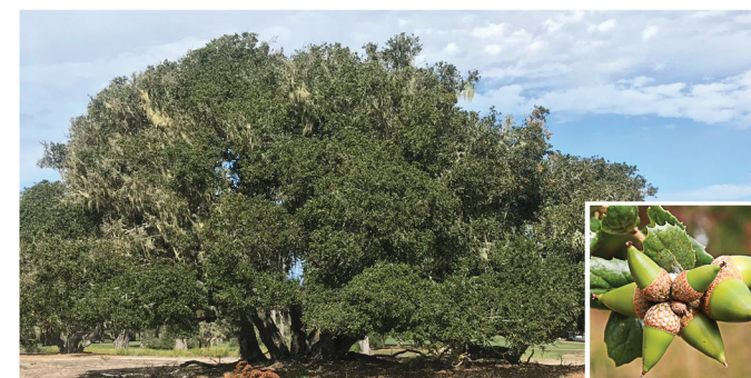
Coast Live Oak