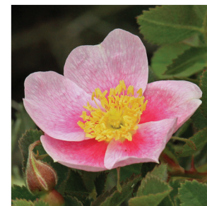
California Wild Rose